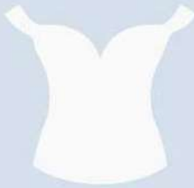
Off The Shoulder